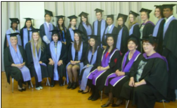
Some of the IMEB Graduates who were able to attend