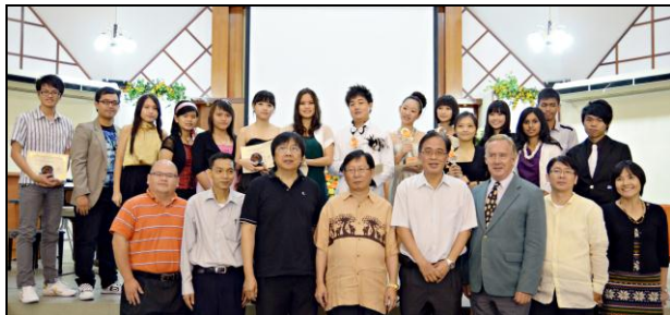
SAGA Committee with Competition Finalists and winners