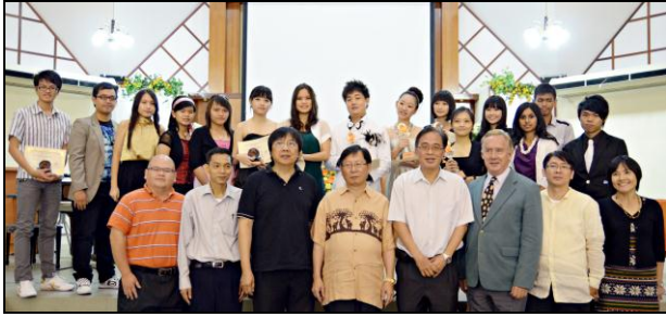
SAGA Committee with Competition Finalists and winners