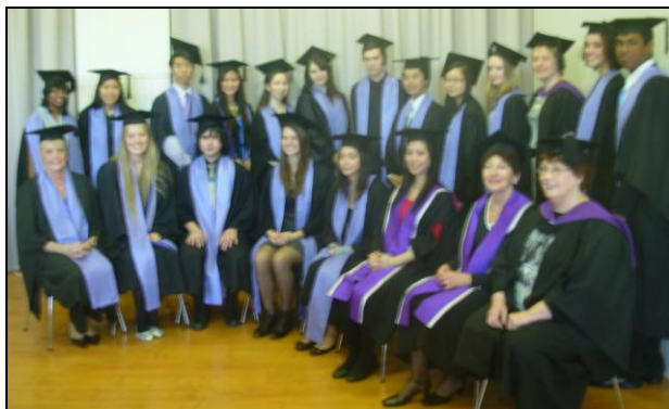
Some of the IMEB Graduates who were able to attend