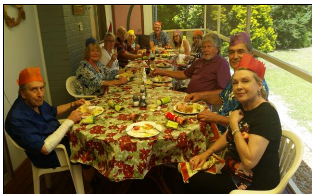
Some IMEB examiners relax at Christmas 2017

Only when these two steps have been completed will requested exam dates be considered. Do NOT send in lists of candidates for examination unless they have paid you in advance, in full, for their exams. (ie: we will no longer accept messages from teachers claiming that they are still waiting for some students to pay up, or that they will send the outstanding balance later !)