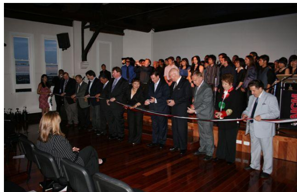
Official party cutting the new AICM Opening Ribbon