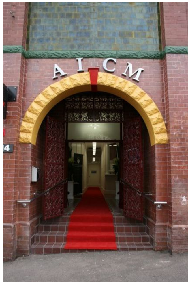
AICM , 114 Victoria Street, Rozelle, Sydney