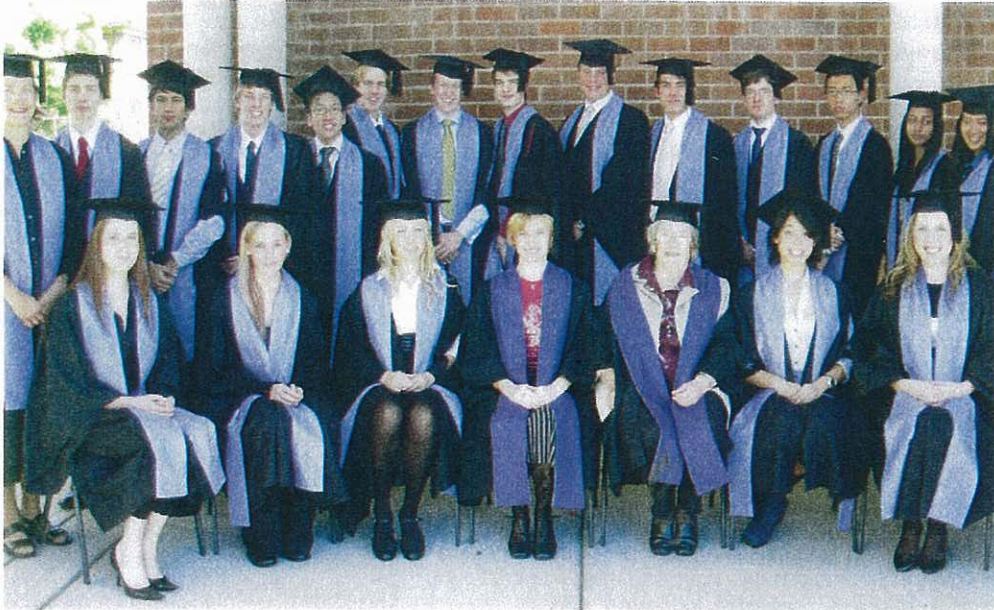
Some of the IMEB Graduates who received diplomas at the Graduation Ceremony on 3 May 2008